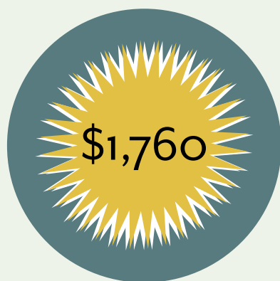
UC San Diego