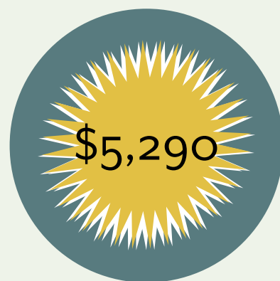
U of Chicago