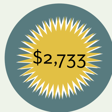
U of Washington