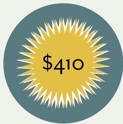
Editors Canada (one test, non-members)